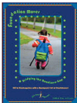
Foundation Moves, DVD & Poster Set