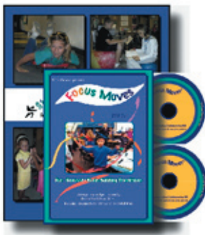
Focus Moves, DVD & Poster Sets